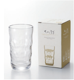
Tumbler L S-5628

M91 T90 H93 ml335 BOX SIZE: W94×D94×H99 1×48=48pcs