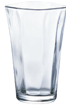
Tumbler L P-6646