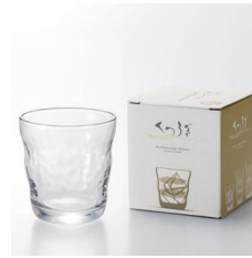
Old Fashioned S-5626

M91 T90 H93 ml335 BOX SIZE: W94×D94×H99 1×48=48pcs